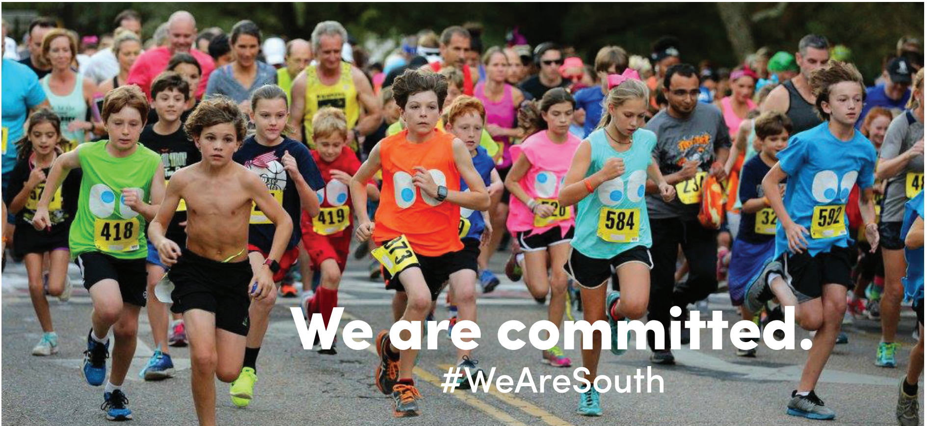
The start of the 2016 Trick or Trot

USA friends and supporters are responding in record numbers to support USA's Children's & Women's Hospital (CWH) and the Mitchell Cancer Institute (MCI) through two annual events.