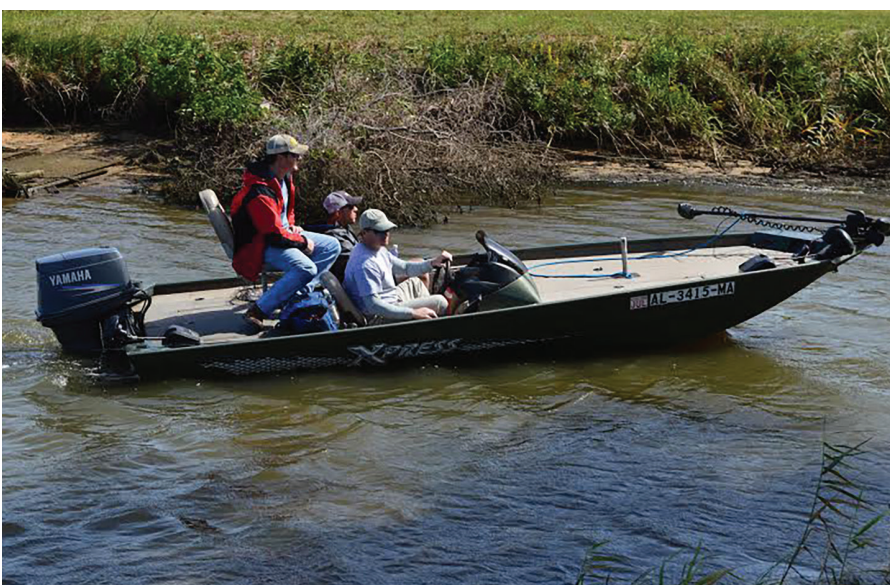
2016 Salty Worm Brackish Classic and Delta Bash

The fifth annual Salty Worm Brackish Classic and Delta Bash is expected to raise $50,000 to support the Gaillard Pancreatic Cancer Research Endowment at the Mitchell Cancer Institute (MCI). The endowment and the event were established by the Gaillard family, who lost two brothers to the disease within a matter of months in 2011.